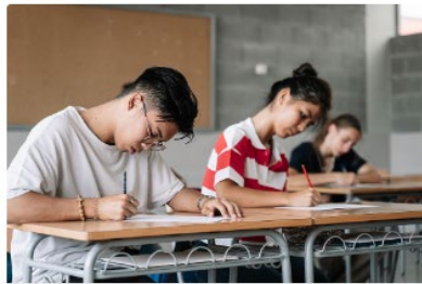
Education and Career Pathways