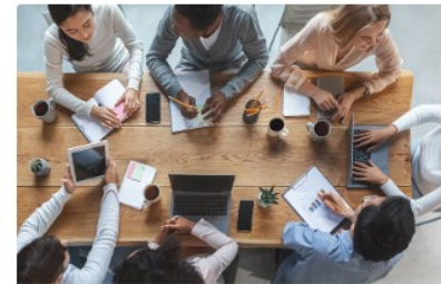
Economic and Workforce Development