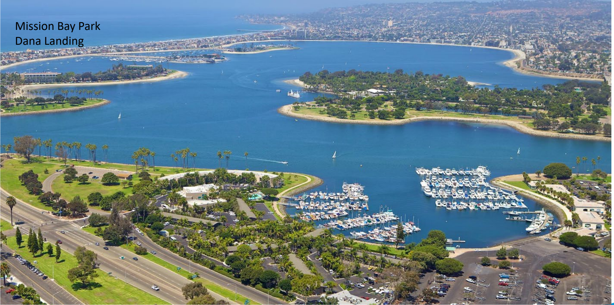
Mission Bay Park Dana Landing