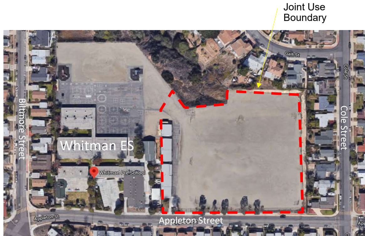
Site Location, Aerial Map

San Diego Unified School District various Capital Improvement Bond Program measures.