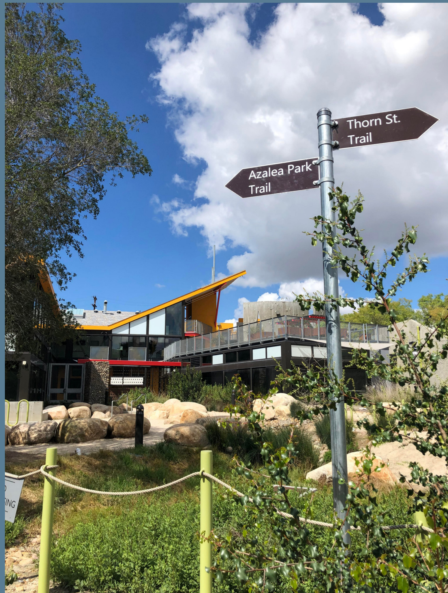
Example of wayfinding signs installed along Loop Trail