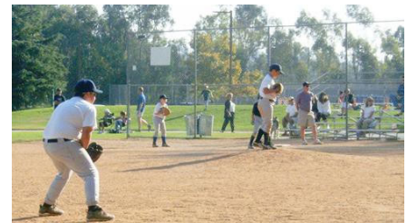
Youth baseball in Jerabek Neighborhood Park Scripps Ranch

As the City has grown, so have the quantity, quality, and distribution of recreation opportunities. New parks and open space have been acquired and facilities and services have been expanded in response to population-based City needs.