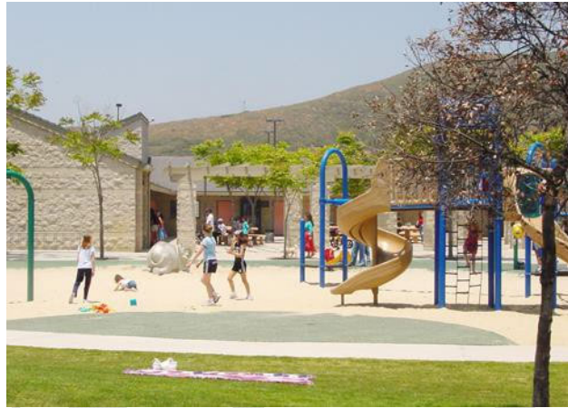
Hilltop Community Park, Rancho Penasquitos

The City of San Diego provides three use categories of parks and recreation for residents and visitors: population-based, resource-based, and open space. These three categories of recreation, including recreational value , land, facilities, and programming, constitute the City of San Diego's municipal park and recreation system.