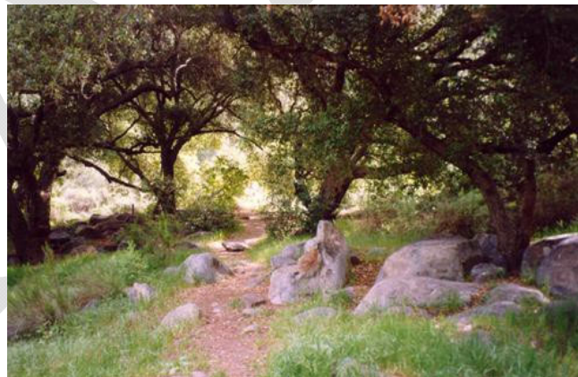
Mission Trails Regional Park

The City of San Diego has over 38,930 acres of park and open space lands that offer a diverse range of recreational opportunities. The City’s parks, open space, trails, and recreation facilities annually serve millions of residents and visitors and play an important role in the physical, mental, social, and environmental health of the City and its residents. Parks can improve the quality of life by strengthening the body and assisting in maintaining physical well-being. Mental and social benefits include visual relief