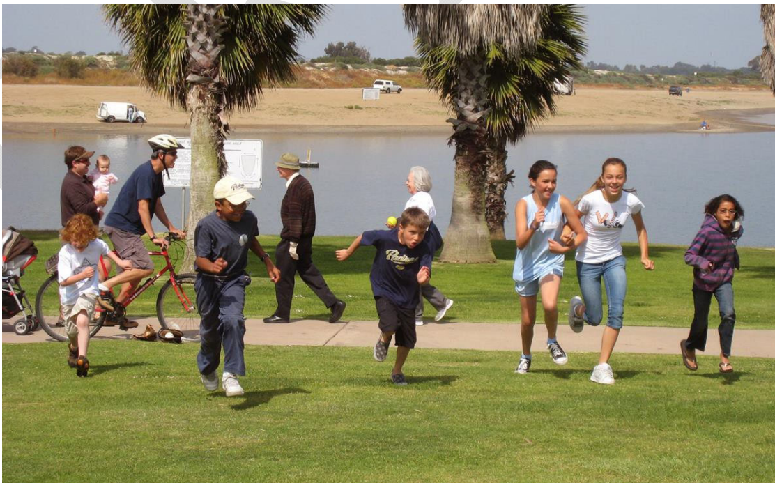
Mission Bay Park

The use of "equivalencies" Implementation of additional recreation strategies that go beyond traditional parks is intended to be a part of a realistic strategy for can allow for the equitable provision of park and recreational facilities, with built-in safeguards designed to protect the public interest . More specific guidance regarding these additional park opportunities is identified in the City's Parks Master Plan, and can be further refined during the development of individual community plans . It is through the proposed development of a citywide Parks Master Plan that "equivalencies" will be addressed on a community-by-community basis. Alternatively, criteria for park and recreation opportunities can be analyzed and established during a community plan update or amendment, or community-specific parks master plan.