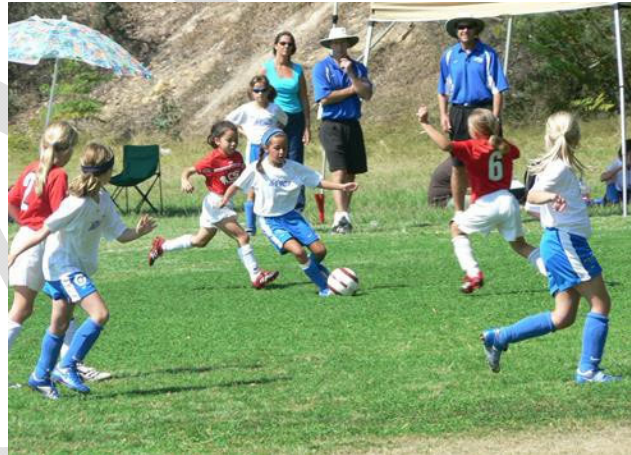
Youth soccer at school athletic field, San Carlos

Creative methods for cost-effective and efficient use of public lands are required if recreation facilities are to be improved, enhanced, and expanded to meet existing and future needs. San Diego's expanding urban development and its desire to acquire, protect and preserve parkland, recreation facilities, and open space have limited the availability of, and placed constraints on, developable lands. One creative means of providing additional lands and facilities for public recreation use is through joint use of public and not-for-profit facilities such as parks, swimming pools, and schools. Joint use facilities can include any land area or physical structure shared by one or more