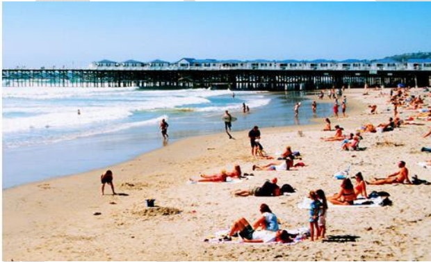
Crystal Pier, Pacific Beach