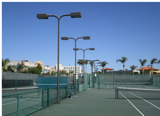
City Heights Community Park