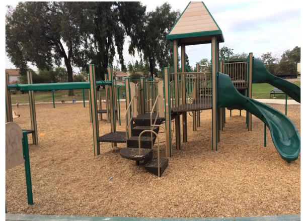
Mesa Verde Neighborhood Park