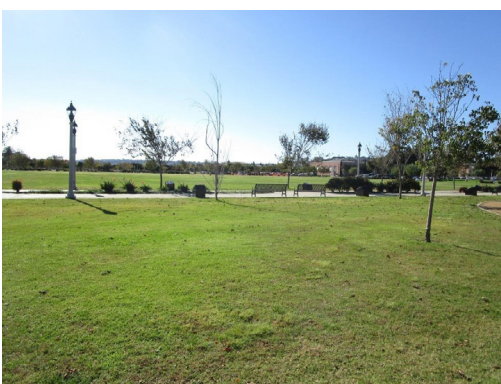
Naval Training Center