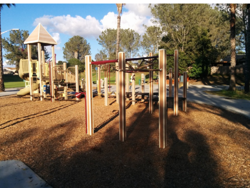
Winterwood Lane Neighborhood Park