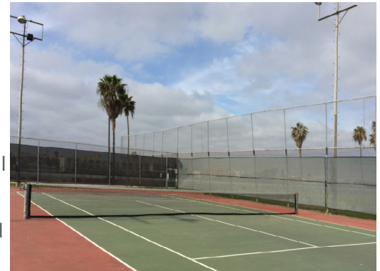
Santa Clara Point

Detailed below is the PCI formula developed for the parks assessments, and a summary of the park amenity assessment findings by park area.