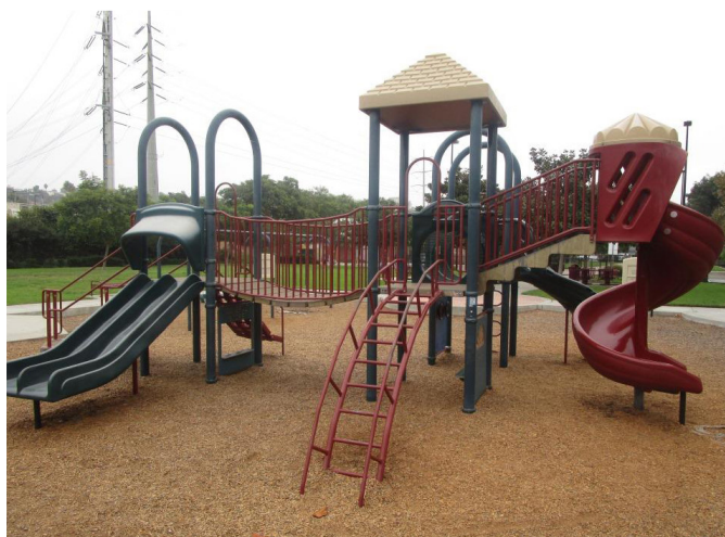
Silver Terrace Mini Park

For the parks included in this assessment, 112,801,312 gross square feet (2,590 acres) were assessed. The Plant Replacement Value for the developed areas for the 235 parks assessed is $1,968,172,155. Individual park PRV's are included in the park amenity assessment reports for each park.