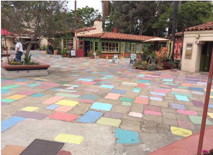
Balboa Park - Central Mesa