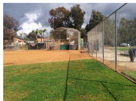
Jerebek Neighborhood Park