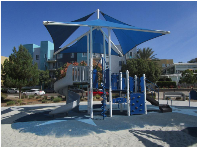
Centrum Neighborhood Park

The following table and figure illustrate the average PCI for the parks based on the facility age (Decade Built). With some limited variations, the year used to determine the park age was either provided directly by the City, or was taken as the “Initial Development” year listed on the park GDP. Overall, the average PCI for parks grouped by decade fell within the “Good” range (PCI 0-20).