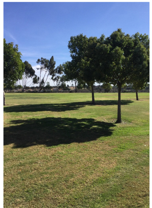
Torrey Del Mar