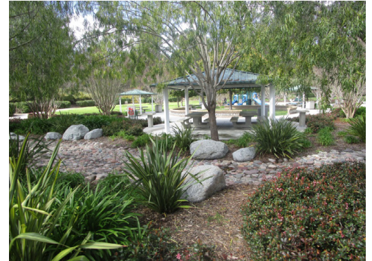
Carmel Knolls Neighborhood Park