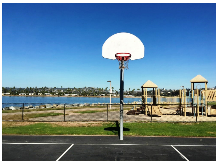
De Anza Cove