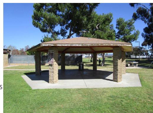
Standley Community Park

As a part of the Reliability Level categories, “Site Development: Playgrounds” have been assigned to Reliability Level 1: Operations Impacts, and “Parking Lots” to Reliability Level 2: Deterioration. The City should begin developing an action plan to address conditions that could put the City at some liability or risk, and decide to either repair or replace the system elements that are beyond their useful life. “Site Development: Playgrounds” are included in Reliability Level 1: Operations Impacts, and are not only crucial to the mission of the parks but may put the City at higher risk due to extended deterioration or potential failure, even though the City ensures the playgrounds are safe. As old play equipment is removed due to age, the play value of the park diminishes resulting in fewer park users thus reducing the park’s ability to achieve the City’s park mission. We recommend that the City focuses on the playground system first.