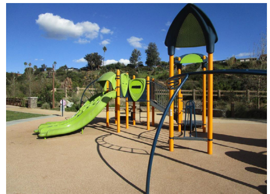
Charles Lewis Memorial Park