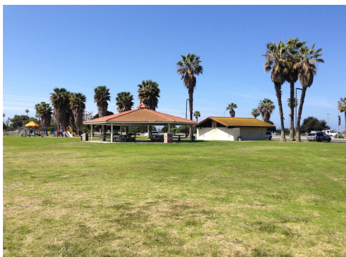
Dusty Rhodes Neighborhood Park

The table below illustrates the average useful life expectations for the park systems used in the assessment. As each park system is made up of multiple elements, the age shown represents the highest occurring element within the system, based upon site observations of the park area assessed. For example, within parking lots, the overwhelming majority of the hardscape observed was asphalt paving, with only minor portions of concrete paving and curbs (if present). Therefore, the useful life expectation for parking lots was based on asphalt concrete rather than standard concrete.