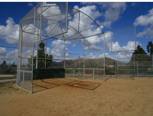
Westview Neighborhood Park