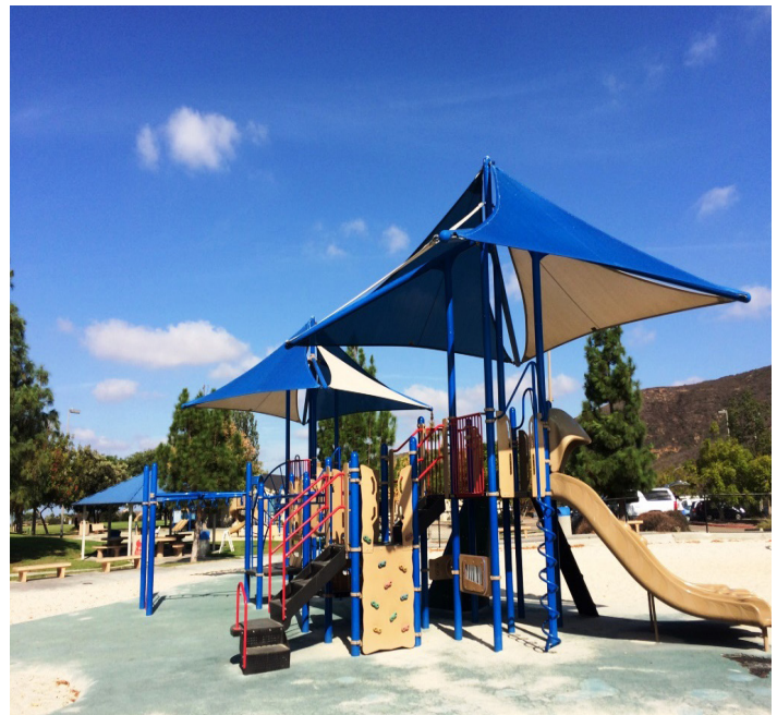
Hilltop Community Park