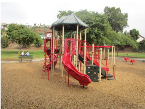
Princess Del Cerro