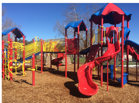
Highland Ranch Neighborhood Park