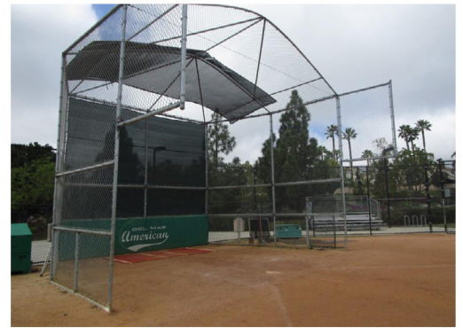
Ashley Falls Neighborhood Park

The cost estimates, the backlog of maintenance, and capital backlogs identified in the facility assessment reports were prepared by Kitchell's estimating department using data from real-time, field-verified construction estimates. The estimates include applicable direct cost and City Cost Index (CCI) adjustments for performing the work, and additional adjustments requested by the City to bring direct costs in line with the City's historical costs for work. Also included are soft costs the City typically applies to administer, design, manage, regulate, and execute the work performed on the facilities. The soft cost factor used for the FY-2019 assessment was set at 1.50 for the purpose of determining the maintenance and capital renewal deficiency cost estimates.