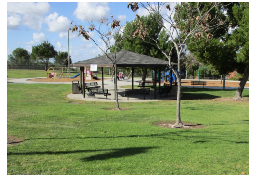
Westview Neighborhood Park