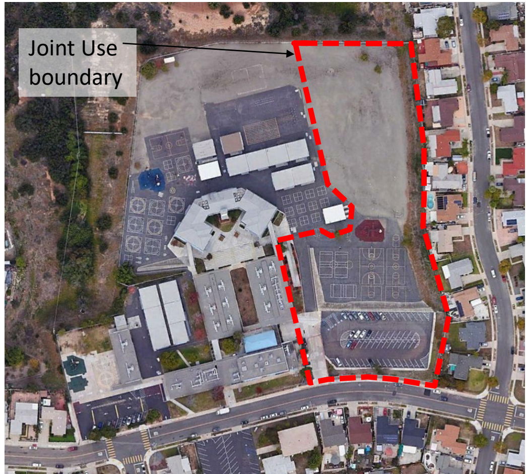
Existing conditions, Aerial Map

San Diego Unified School District various Capital Improvement Bond Program measures.