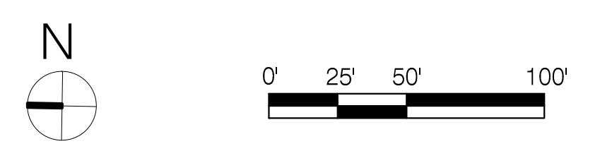
GDP SITE PLAN SCALE: 1:150

EXISTING UNDEVELOPED PROPERTY NOT A PART