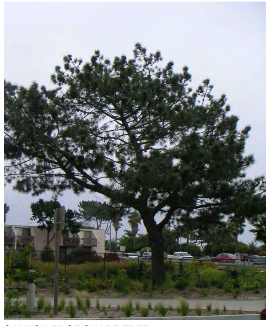
CANYON EDGE SHADE TREE PINUS TORREYANA TORREY PINE