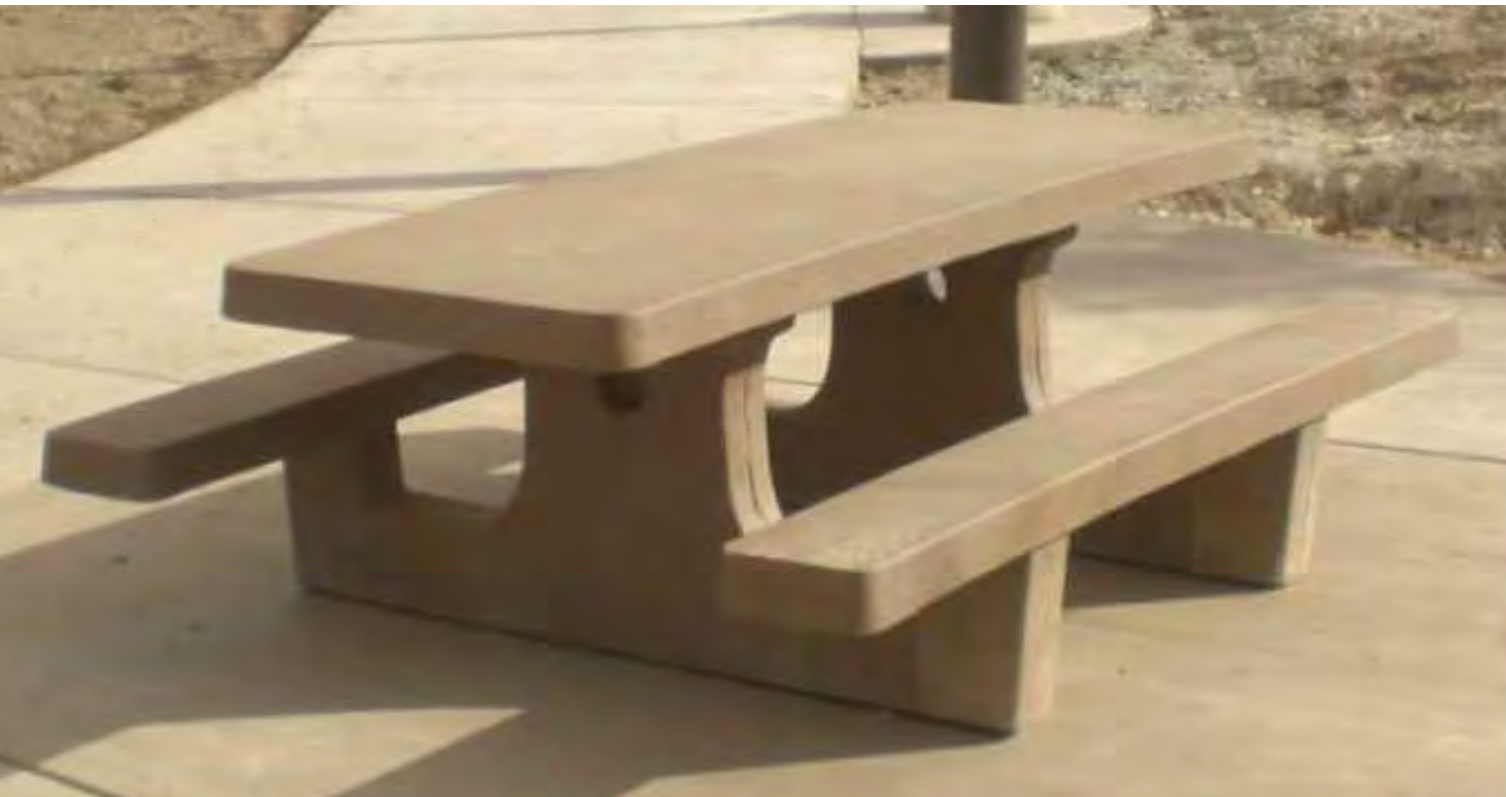
PICNIC TABLE - OUTDOOR CREATIONS INC.