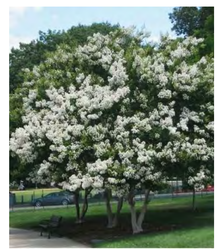
ACCENT TREE LAGERSTROEMIA 'NATCHEZ' NATCHEZ CRAPE MYRTLE