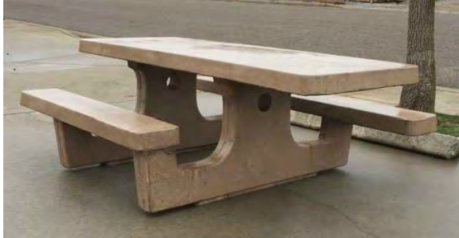
ACCESSIBLE PICNIC TABLE - OUTDOOR CREATIONS INC.