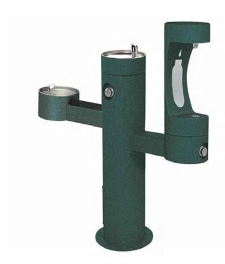
DRINKING FOUNTAIN - ELKAY