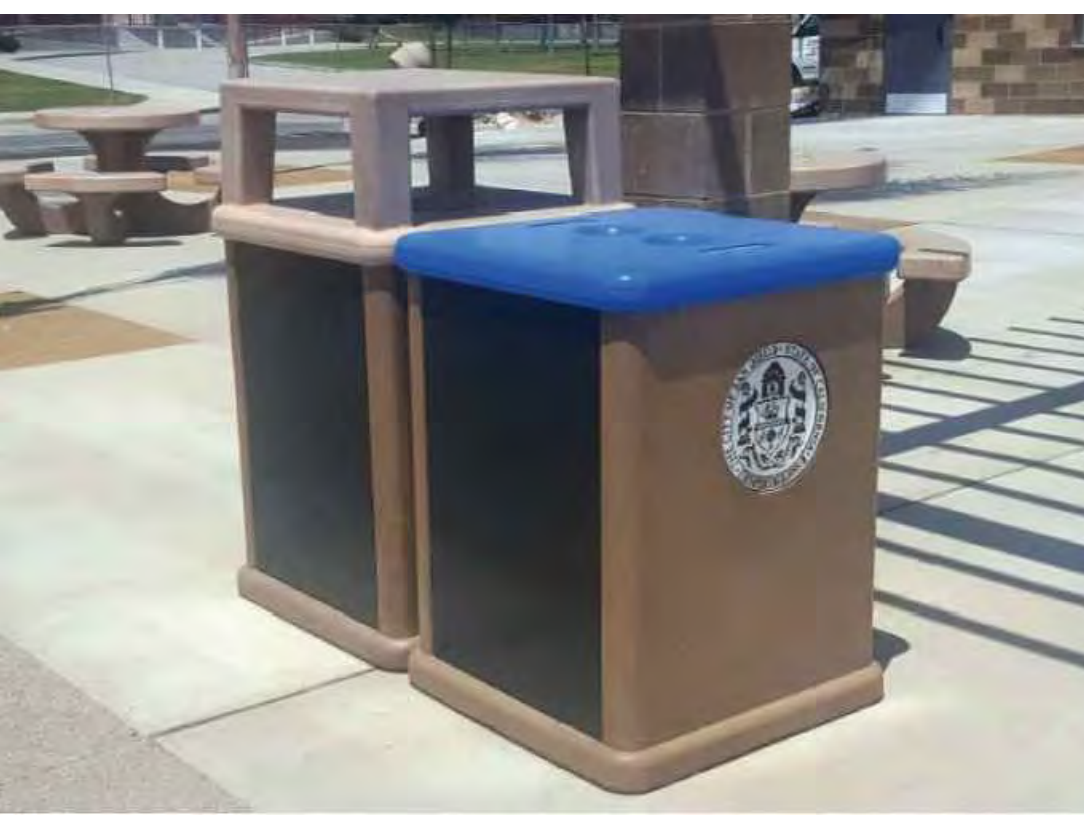
TRASH & RECYCLE RECEPTACLES - OUTDOOR CREATIONS INC.