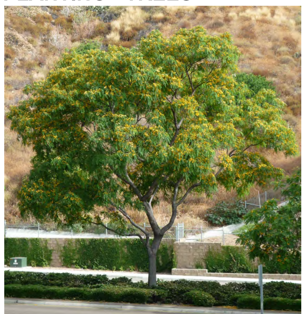
PARKING LOT SHADE TREE TIPUANA TIPU TIPU TREE