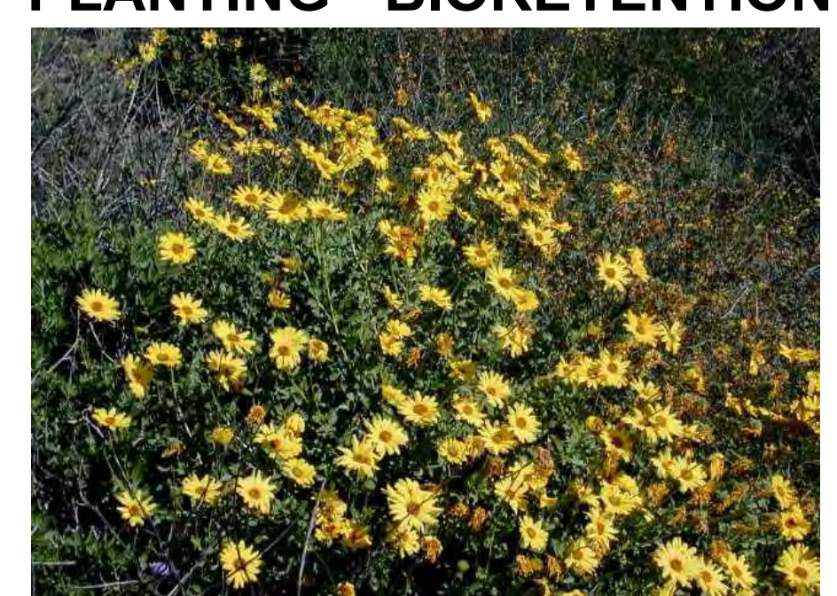
ENCELIA CALIFORNICA COAST SUNFLOWER