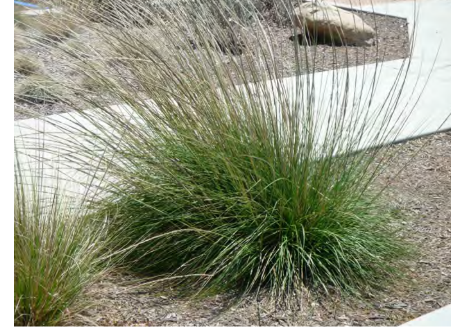
MUHLENBERGIA RIGENS DEER GRASS