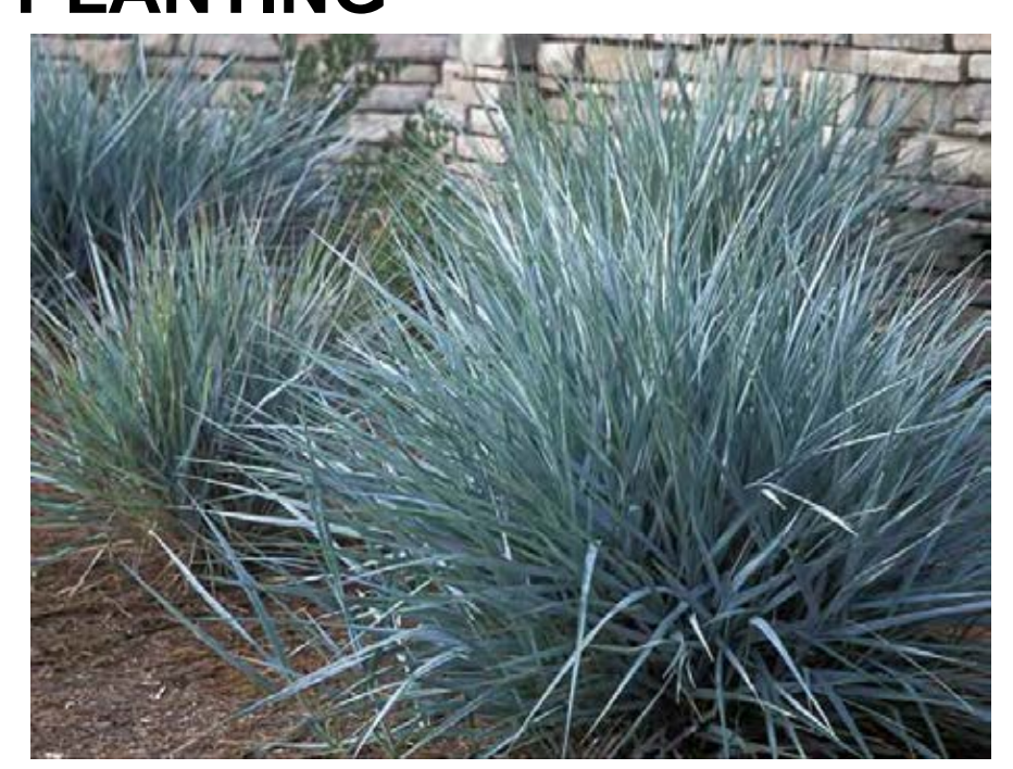
LEYMUS CONDENSATUS 'CANYON PRINCE' CANYON PRINCE GIANT WILD RYE