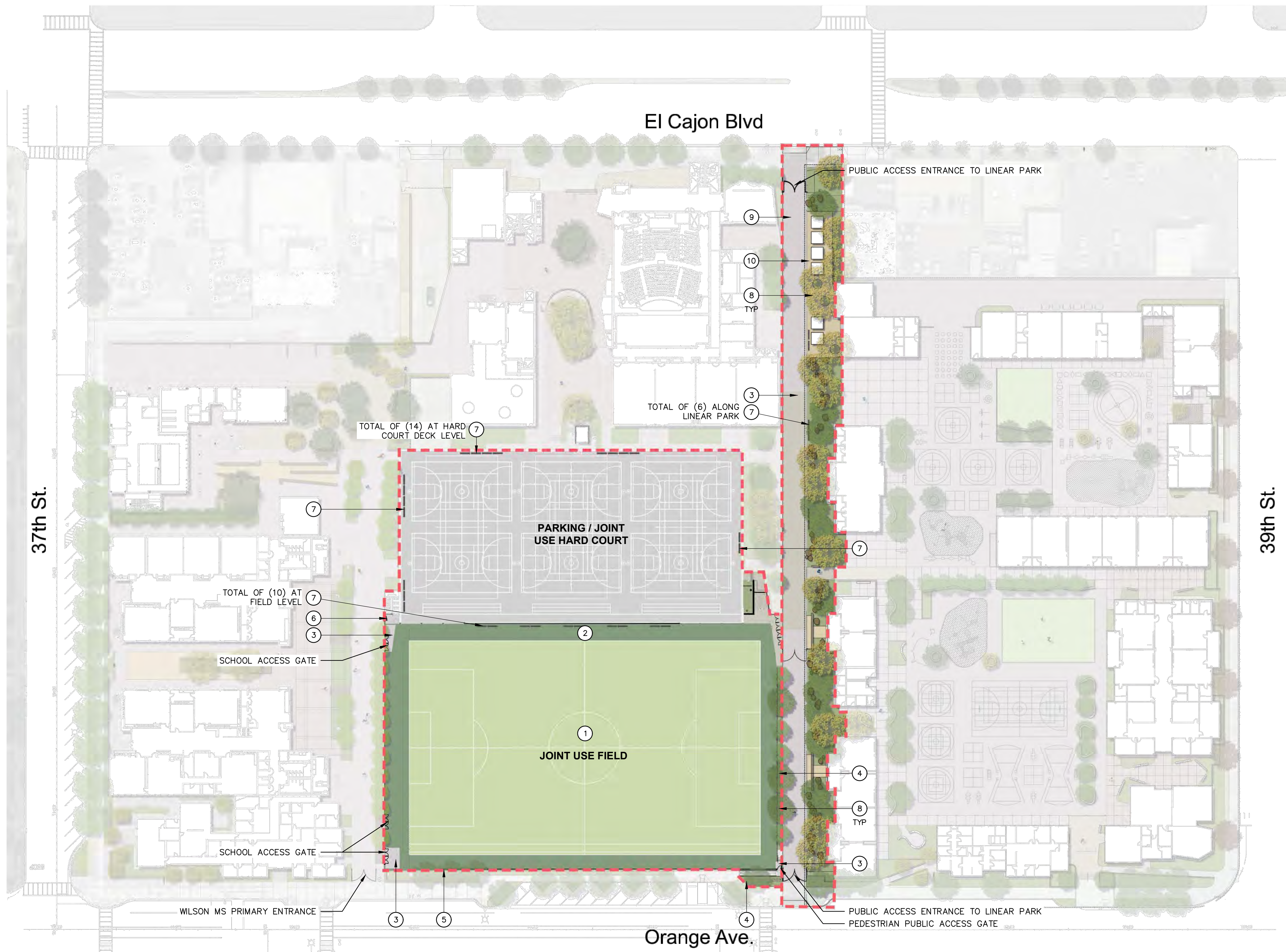
SITE PLAN DRAFT CONCEPT 11/08/2021