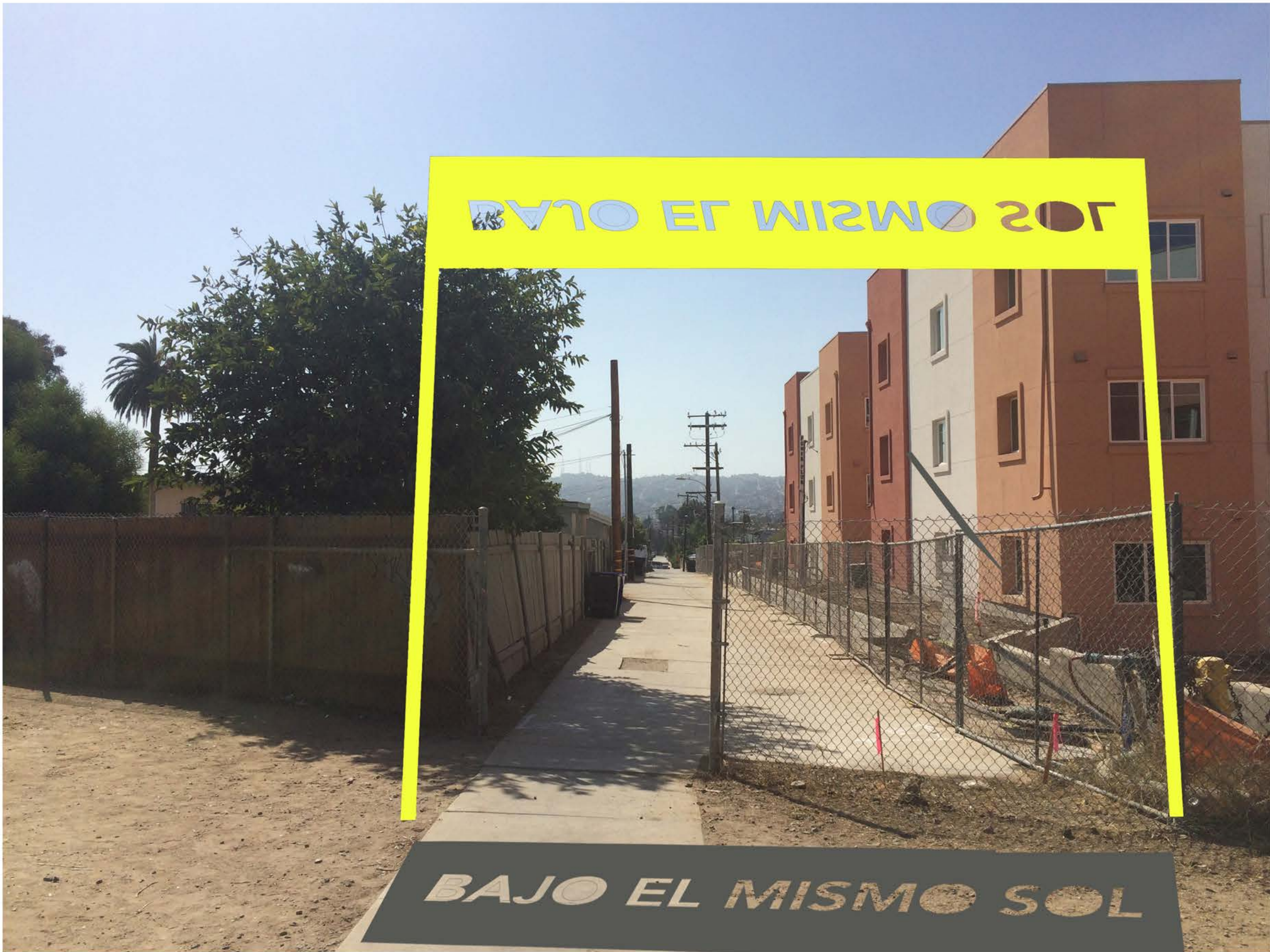
Artist rendering of the artwork.