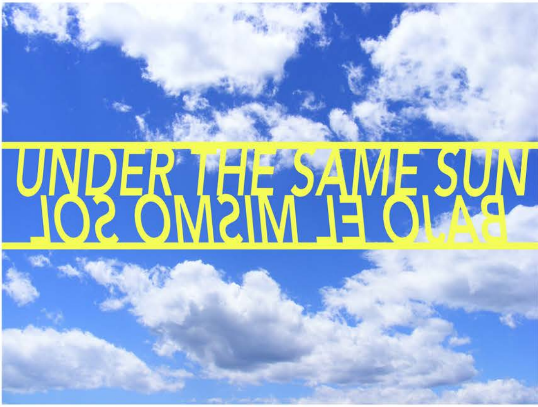
ABOVE: Artist renderings of possible text and color choices.