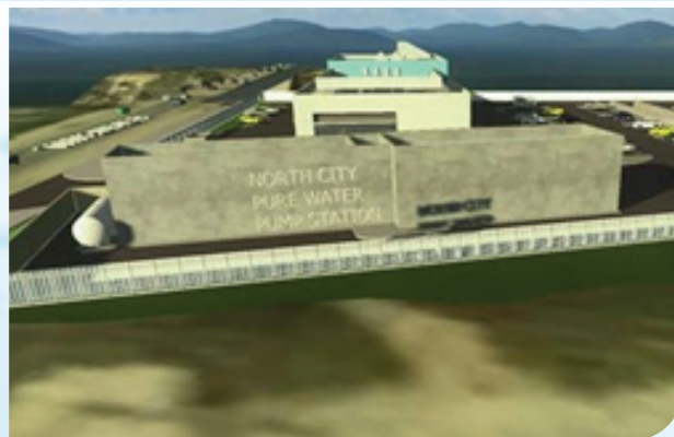
| Rendering of the North City Pure Water Pump Station