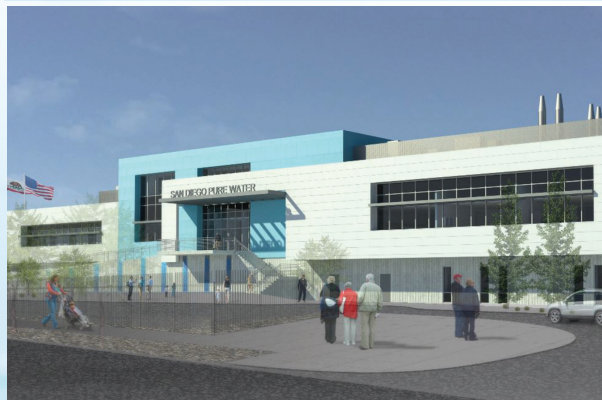
| Rendering of the North City Pure Water Facility