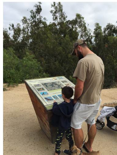
Interpretive signs and trail head kiosk signs educate the community about the biology and the cultural value of the Uptown open space system.