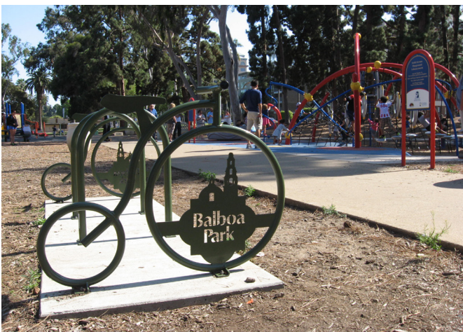
Sixth Avenue Children's Playground is located in Balboa Park and features several play areas, picnic facilities and passive lawn areas.

In addition to the inclusion of these projects in the Uptown Public Facilities Impact Analysis, identification of potential donations, grants and other funding sources for project implementation will be an ongoing effort. Figure 7-1, Parks, Recreation Facilities and Open Space, depicts the approximate locations of existing and proposed parks, recreation facilities, park equivalencies and open space.