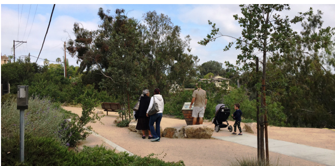
West Lewis Pocket Park provides passive recreation amenities including seating, interpretive signage and drought tolerant landscaping.

Preservation can also include the enhancement of resource-based parks and open space that provides a balance between protecting the natural resources and allowing for a certain level of public recreation use. For the Uptown Community, this would mean concentrating active recreational use improvements towards larger resource-based parks, and focusing passive use improvements at various open space areas, mini-parks and pocket parks. Aside from trails, only passive uses are allowed in the City's Multi-Habitat Planning Area (MHPA), therefore, to protect the natural resources and still add recreation value, interpretive signs should be featured at open space parks to educate the public on the unique natural habitat, scenic value and the history of the place.