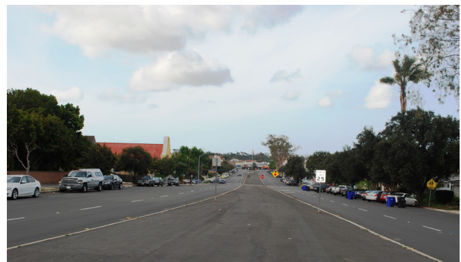
Streets with excessive right-of-way should be considered for potential recreational, urban greening, and multi-purpose opportunities.

RE-1.16 Explore the possibility of providing a public park within the redevelopment of the San Diego Unified School District's Education Center on Normal Street.