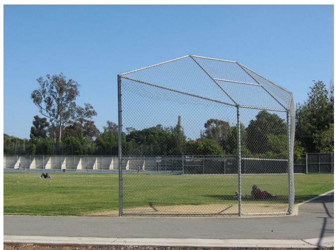
Roosevelt Middle School Joint Use Facility provides play fields, walking track and tennis courts.