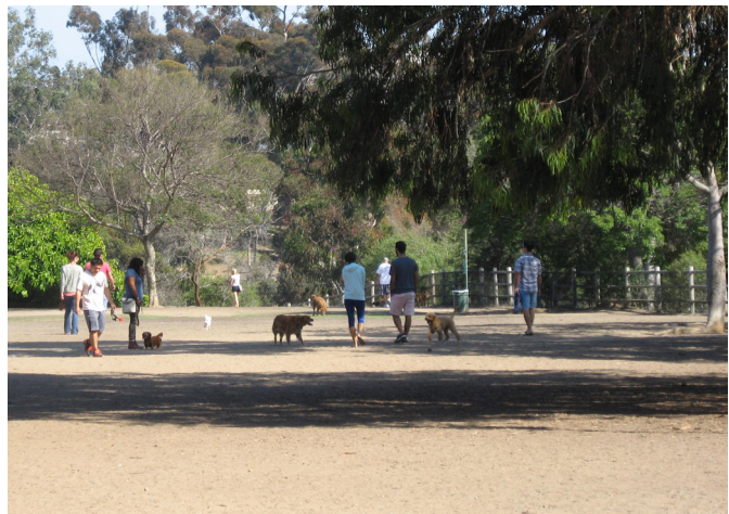
Nate's Point Dog Off Leash Area is a very popular recreation facility and is located within Balboa Park.