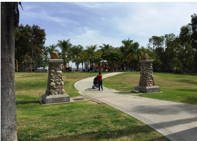
Old Trolley Barn Park is a neighborhood park that provides passive recreation and plays host to community concerts and festivals.

In addition to soliciting public input through various stakeholder meetings and the community plan update advisory committees, in August of 2011, the City commissioned a Park and Recreation Needs Assessment for the Golden Hill, North Park and Uptown Communities. The assessment was conducted by an independent research consultant to determine how and where the communities currently recreate, their priorities and preferences for future recreational uses and facilities within their communities, as well as, consideration of Balboa Park as a recreational resource. The assessment consisted of an objective, statistically-valid, random telephone survey. The survey results, which were representative of the broad and demographically-diverse communities' recreational use patterns and opinions, were contained in a report presented to each community, and have been incorporated into this plan update where appropriate. (See Appendix B for a summary of the Park and Recreation Needs Assessment Survey).