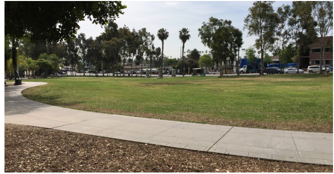
Access to park and recreation facilities should provide accessible pathways from the public sidewalk or from parking areas.

Accessibility also means the availability of active and passive recreation to all community residents. When special uses are designed into parks, such as dog off-leash areas or community gardens, these areas should also include amenities, such as pathways, benches, exercise stations, or picnic tables on the perimeter that could accommodate more than one type of user and enhance the recreational and leisure experience. Special uses, such as dog off-leash areas and community gardens, would be required to undergo a City approval process prior to facility design.