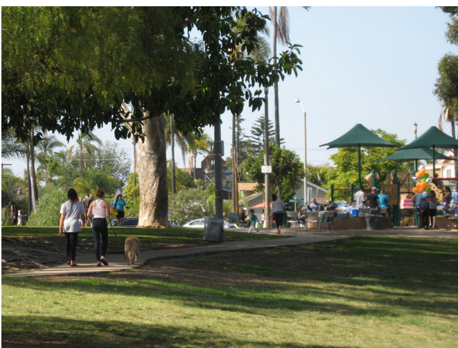
Mission Hills/ Pioneer Memorial Park features large multi-purpose fields, children's play areas and picnic facilities.

Aquatic Complex: serves population of 50,000: 56,025 people divided by 50,000 people = 1.12 Aquatic Complexes