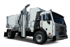
Side Loader/ Packer