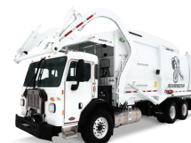
Front Loader/ Packer