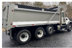
3 Axle Truck