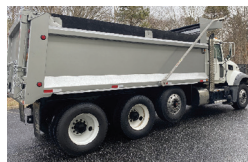
3 Axle Truck