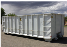
Containers 15 Cubic Yards and Greater

Containers 15 Cubic Yards and Greater, Roll-off/Drag-on Tractor, 3 Axle Truck, Front Loader/Packer, Side Loader/Packer, Rear Loader/Packer, Pup Trailer, End Dump, Semi