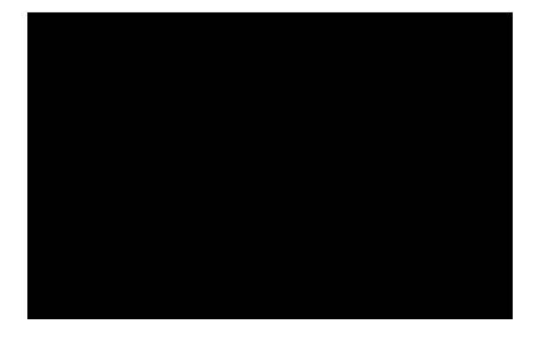
Task 1 – Translation of written documents and materials