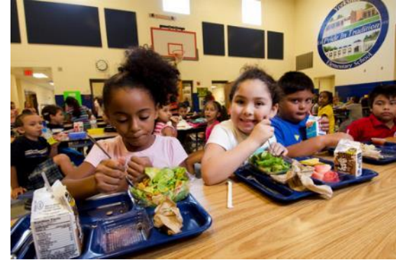
Hunger Free Kids Program