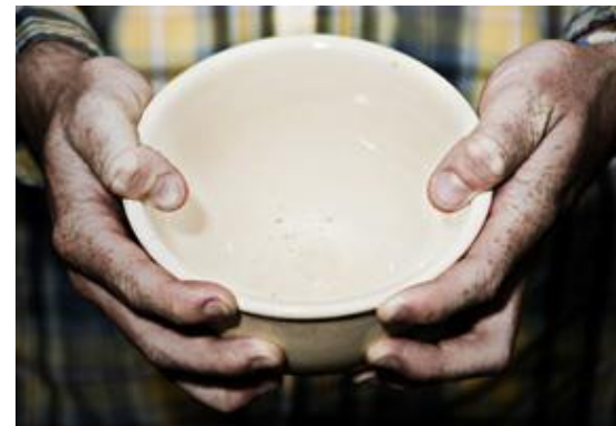
Hunger Free San Diego