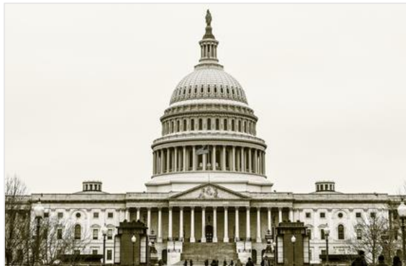
Public Policy & Advocacy