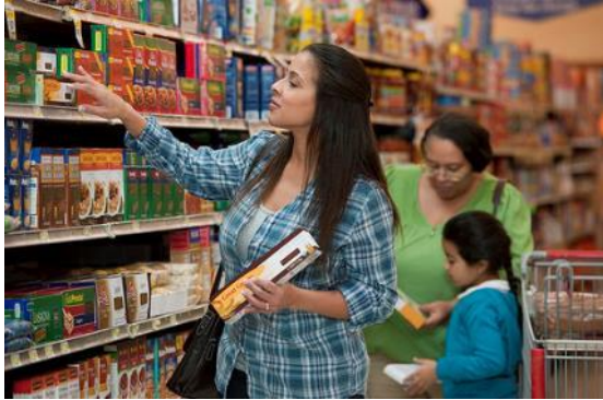
CalFresh Outreach Program