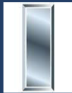
5. 1 ST LIEUTENANT