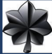
2. LT. COLONEL