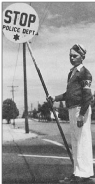
School Safety Patrol in 1935

The children of School Safety Patrol give hundreds of hours of their own time during their commitment to the program. They are dedicated, confident and strong role models for their peers. They are truly proud of being a member of this program.