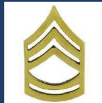
8. SERGEANT 1 ST CLASS