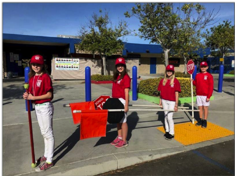
School Safety Patrol in 2018