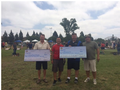
MIRA MESA: We hosted our 2 nd Annual D6 Charity Toss on Saturday, August 19 th . In total, $25,000 was raised for the San Diego Police Officers Widows & Orphans Fund and the Drowning Prevention Foundation San Diego .