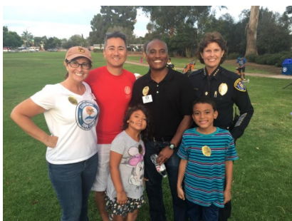
CLAIREMONT: I dropped by Clairemont Town Council's National Night Out celebration on August 1 st .