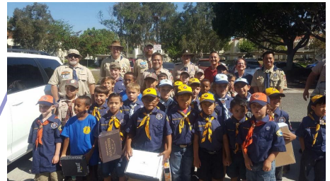
MIRA MESA: On August 21 st , I stopped by the Mira Mesa Library to watch the solar eclipse with the Boy Scouts (Rancho Mesa District). The Scouts made their own solar eclipse viewers.