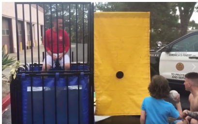
RANCHO PEÑASQUITOS: On August 1 st , I volunteered to sit in a dunk tank for Rancho Peñasquitos' National Night Out celebration.