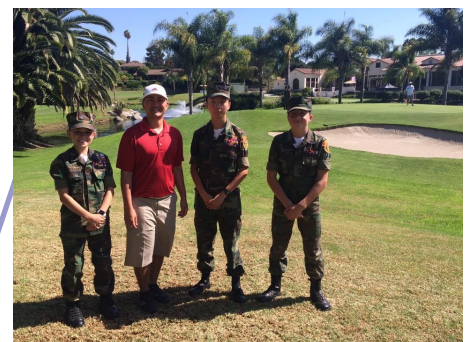
KEARNY MESA: I participated in the San Diego Financial Literacy Center's (SDFLC) 4 th Annual Boost For Our Heroes Golf Classic on August 21 st . The SDFLC's Boost for our Heroes is a financial assistance and education program that benefits military members and their families, headquartered in Kearny Mesa.