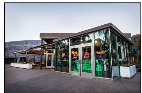
James' Place blends fine dining with "La Jolla laidback" vibes to create a hip happy hour and dining experience.