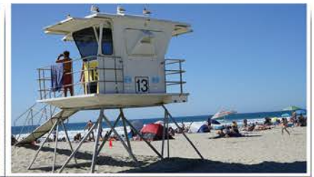
Summer 2015 and 2016 Participation