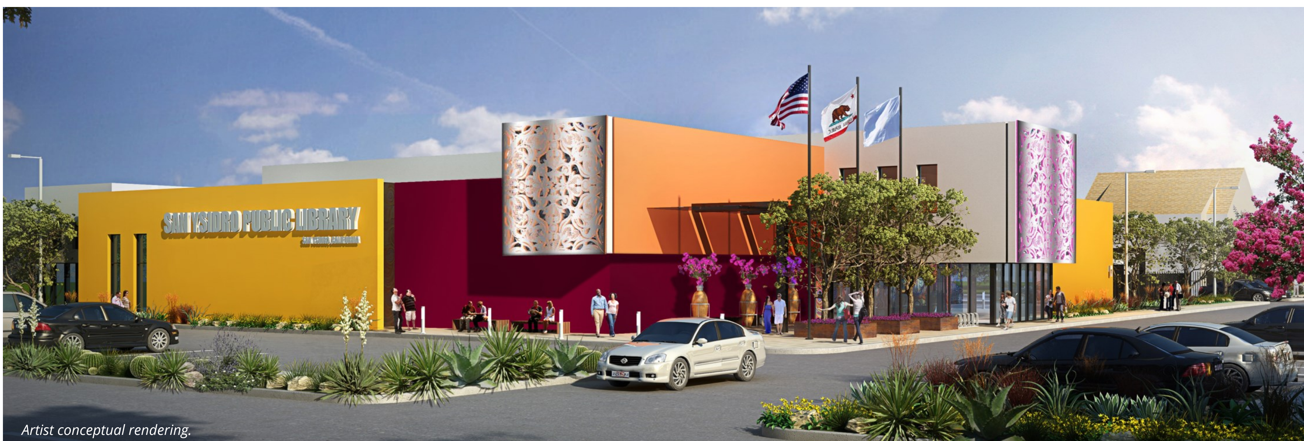
Artist conceptual rendering.