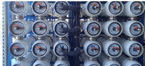
Barrier 4 Reverse Osmosis

Membrane filtration uses canisters filled with straw-shaped hollow fibers that provide 99.99% removal of microscopic particles including suspended solids, bacteria and protozoa. The filters are tested daily to confirm their consistent removal of contaminants. The pores in the fibers are smaller than 1/300 the diameter of a human hair.