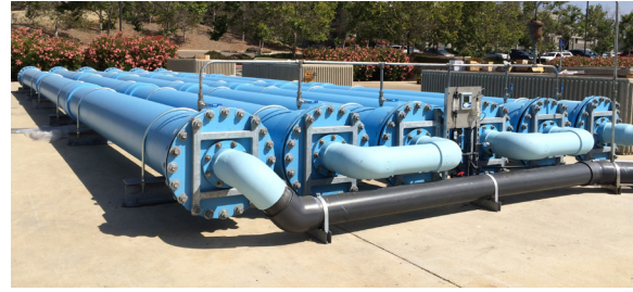
Barrier 1 Ozonation