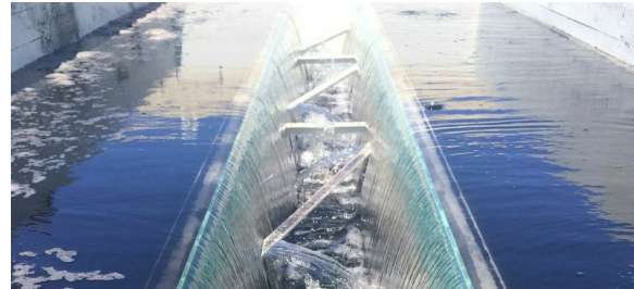
Barrier 2 Biological Activated Carbon Filters

Ozone is a gas produced by subjecting oxygen molecules to high electrical voltage. The ozone gas is infused into the water and the water travels through a long series of pipes, called the ozone contactor. The ozone destroys microorganisms and reacts with and breaks down contaminants in the water. Prior to the next step, the ozone is consumed and breaks down into oxygen.