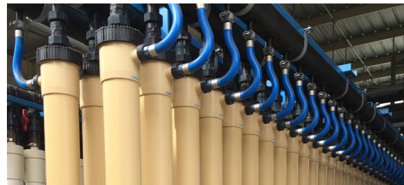
Barrier 3 Membrane Filtration

Biological activated carbon (BAC) filters are filled with carbon granules covered in "aerobic" bacteria, which thrive in the presence of oxygen. The bacteria on the granules consume 30-50% of the organic matter (anything that is or was living). The "helpful" bacteria, along with any other bacteria still in the water, are removed in the next treatment step.