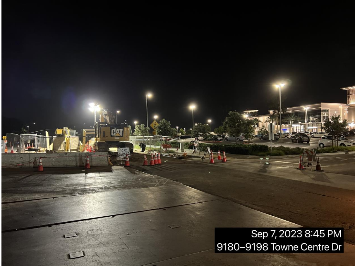
Sep 7, 2023 8:45 PM 9180-9198 Towne Centre Dr