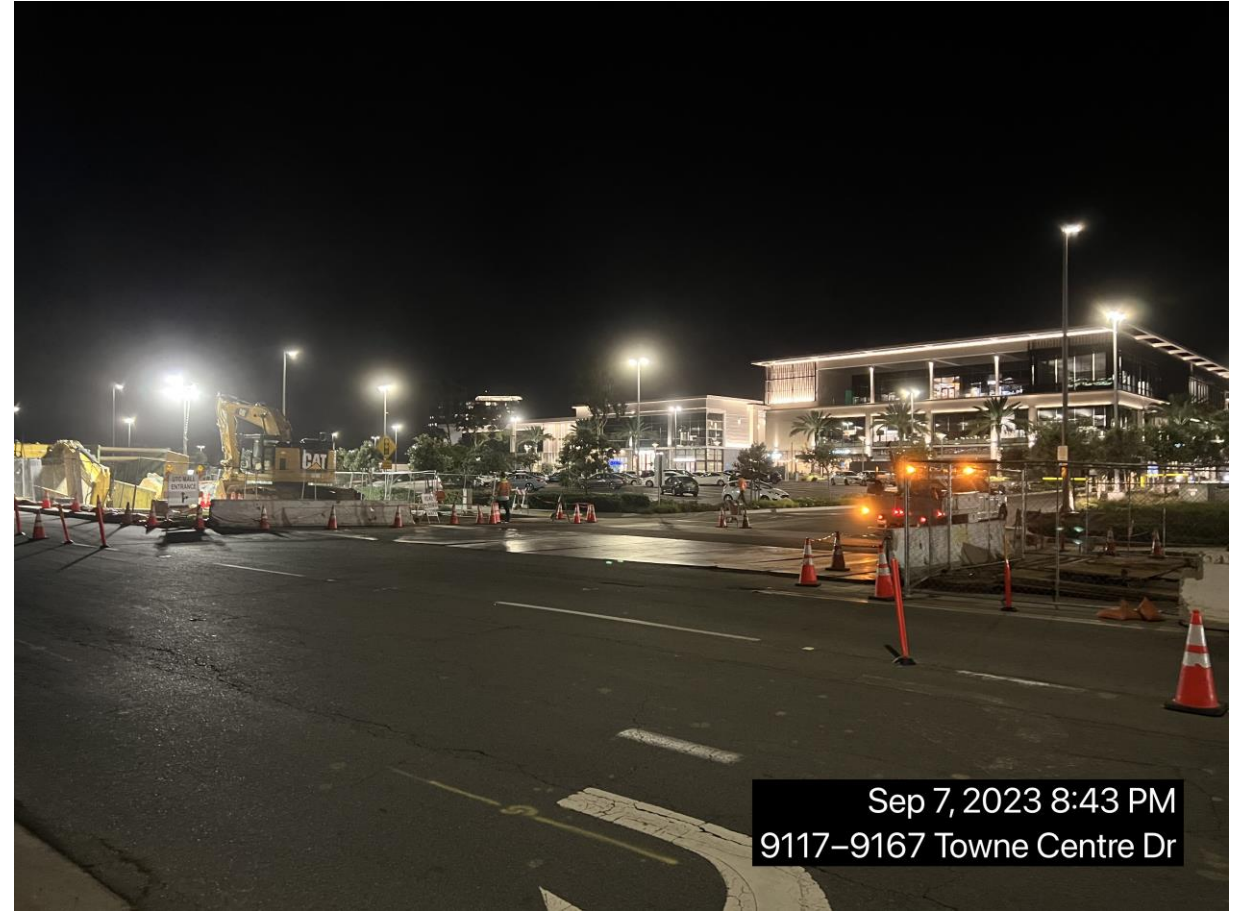
Sep 7, 2023 8:43 PM 9117-9167 Towne Centre Dr