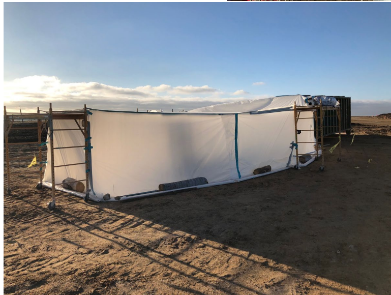
Disposal of loose, friable asbestos containing acoustic and subsequent cleanup City of San Diego, Environmental Services Department, Hazardous Substances Enforcement Team