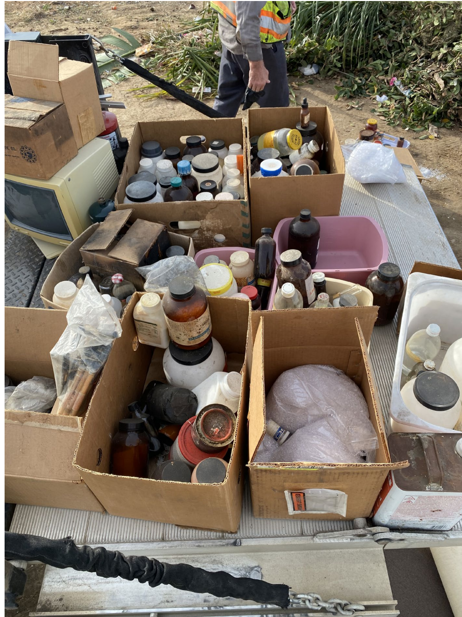
Corrosive, oxidizing, reactive, toxic, and flammable chemicals from a residential cleanout City of San Diego, Environmental Services Department, Hazardous Substances Enforcement Team