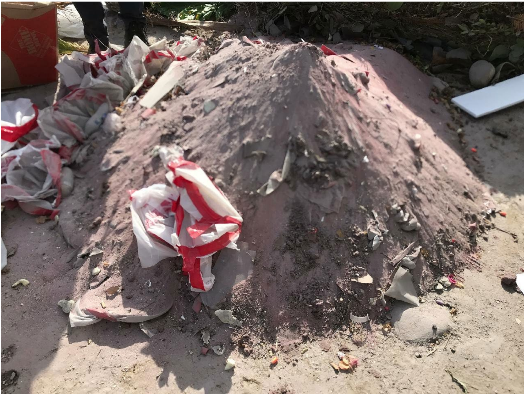
Sandblast media that exceed hazardous waste threshold for zinc

City of San Diego, Environmental Services Department, Hazardous Substances Enforcement Team