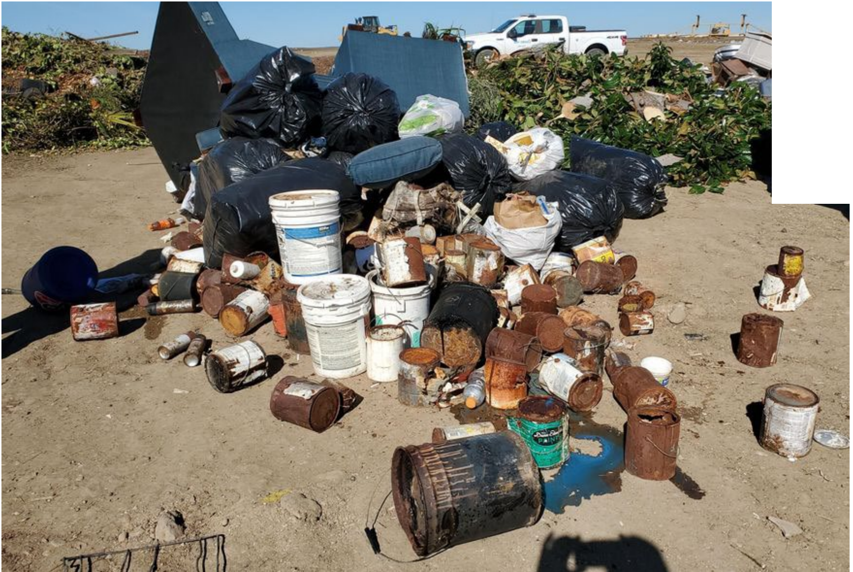
Approximately 100 gallons of paint disposed at the public tipping deck City of San Diego, Environmental Services Department, Hazardous Substances Enforcement Team