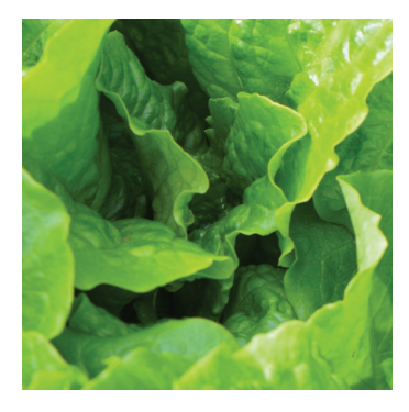
Separating organics - food scraps and landscape waste - helps our environment.