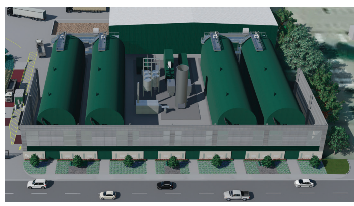
EDCO's Anaerobic Digestion Facility

Since 1967, family owned and operated EDCO has had a long-standing commitment to reducing impacts on the environment through innovation. EDCO's state-of-the-art AD Facility began serving customers in early 2021, assisting customers to be in full compliance with state mandates and keeping us On the Road to Zero Waste .