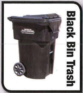
Black Bin Trash