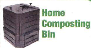
Home Composting Bin