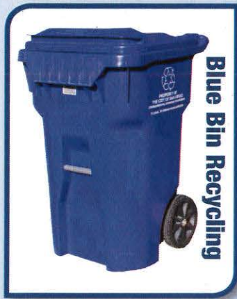
Blue Bin Recycling