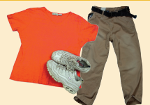
Clothes and shoes