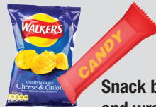
Snack bags and wrappers