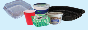
Clean plastic food containers and cups