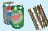
Aluminum and metal cans