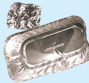
Clean aluminum foil and trays