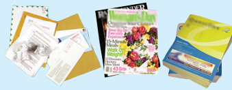
Mail, magazines, catalogs and phone books