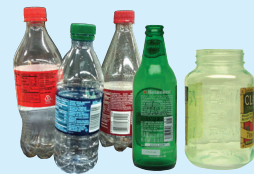
All glass and plastic bottles and jars