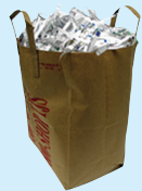
Paper bags Shredded paper (bagged and tied)