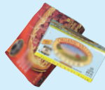
Paper or frozen food boxes