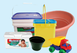
Plastic buckets, tubs, pots, trays and toys