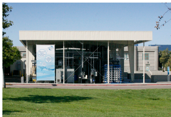
Schedule a tour of the Advanced Water Purification Facility

The challenges discussed by these agencies are important to you because San Diego imports as much as 85% of its