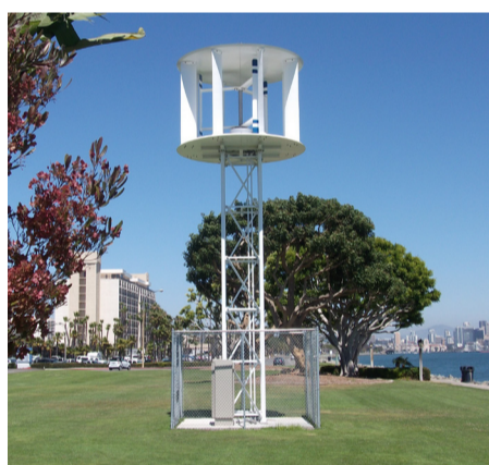
Pilot Project's vertical-axis wind turbine converts wind to energy.

The project demonstration placed a 30-foot tall vertical-axis wind