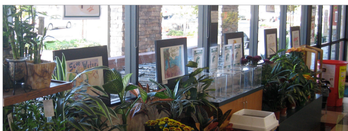
Shop and learn about how to “waste no water” at your local grocery store.

The award-winning Water Conservation Posters, created by our local school children, are just too good and should be shared. That's why your Public Utilities Department is going to put the 19 winning posters on display at local libraries and grocery stores this winter. When you are buying groceries for family meals or checking out a book to read, don't be surprised if you find these posters at your neighborhood locations: